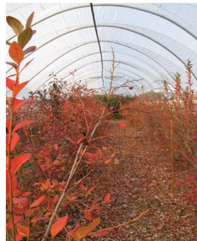
Hoophouses are not just for salad crops anymore. In an upcoming article, Growing for Market will tell you about high tunnel production of perennials such as blueberries (pictured above in full autumn color), raspberries, tree fruits, and peonies.

Tens of thousands of hoophouses have been built in the past decade, bringing profound changes to market farming: longer farmers market seasons, winter markets and CSA shares, new crops, higher quality produce. Nearly every successful grower we know has at least one hoophouse and we have never heard anyone say they wish they hadn't spent the money on it. USDA's Natural Resources Conservation Service (NRCS) gave high tunnel grants to 2,300 farmers last year, and is expected to fund the same numbers in 2011 and 2012. But even if you don't get a grant, you can't go wrong with a high tunnel. Most growers find they can pay for the structure within two years; with high-dollar crops such as cut flowers and strawberries, the cost can be recouped in one year. Growing for Market has been a leader in covering hoophouse production, and you'll find plenty of resources on our website that will help you get started in this lucrative business.