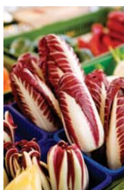
Coming up in GFM: Growing radicchio and other chicories for restaurants.

People are eating more kinds of fresh produce than ever before. Take spinach. U.S. consumption of fresh spinach has grown 500% since 1980. Or sweet potatoes, which were once eaten only at Thanksgiving and now are showing up everywhere (e.g., sweet potato fries). Crops that were once very minor on most farms are growing in importance and a lot of times they are surprisingly profitable. GFM keeps you informed about food trends and new crops so you don't miss any opportunities.