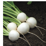
Turnip - Hakurei White Japanese salad turnip is sweet and fruity, and the texture is crisp and tender.