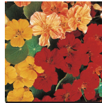
Nasturtium - Whirlybird Mix Peppery flavor. Mixture

Available: March - May, September - December