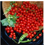
Tomato - Matt's Wild Cherry Small cherry tomatoes are tender, full-flavored with a high sugar content.

Available: May - July, September - October