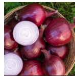
Onion - Red Carpet Strong onion flavor. Long storing.