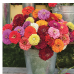
Zinnia - Benary Giant Vigorous all-season. Densely petaled blooms are up to 6" across.