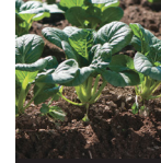
Tatsoi - Koji Dark green, hybrid tatsoi for bunching or baby leaf. Excellent in salad mix.

Available: May - July, September - October