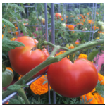
Tomato Ramapo Jersey tomato. Flesh is smooth and juicy. The ideal tomato flavor.