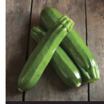
Squash - Spineless Perfect Summer squash, medium-green type. Straight fruits on an open plant.

Available: May - July, September - October