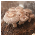
Mushroom - Shiitake Umami flavor. Wild cultivated.

Available: March - May, September - December