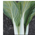
Pak Choi - Bopak Dark green leaves, white petiole. Flavor lingers between mild cabbage and spinach.

Available: May - July, September - October