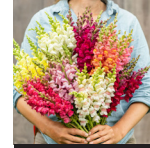
Snapdragon - Potomac Mix Blend of warm sunrise shades.