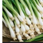
Scallion- White Lisbon Long, slender, tasty stalks in clusters with spring green ends.