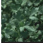
Parsley Flat, dark green leaves are flavorful and used for tabouli, meat, soups and salads.

Available: May - July, September - October