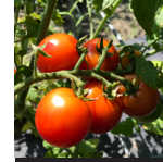
Tomato - Cherry Sakura Delicious, juicy, sweet flavor. Thin skin yet firm.

Available: May - July, September - October