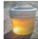
Truffle Honey Honey infused with French black truffles. Delicious on cheese, toast, or ice cream.